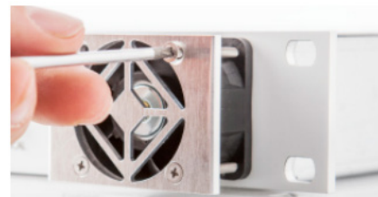
Easily exchangeable fan